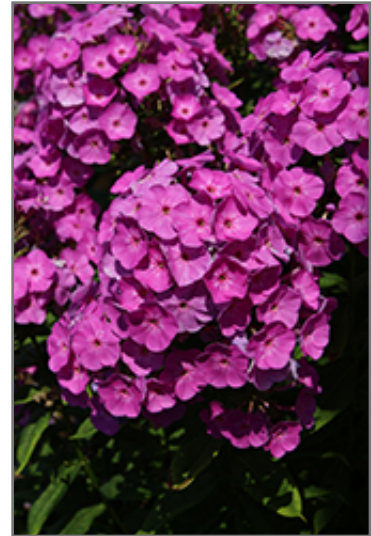
Garden Girls Cover Girl Garden Phlox flowers