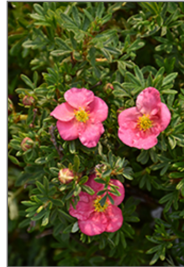
Bella Bellissima Potentilla flowers