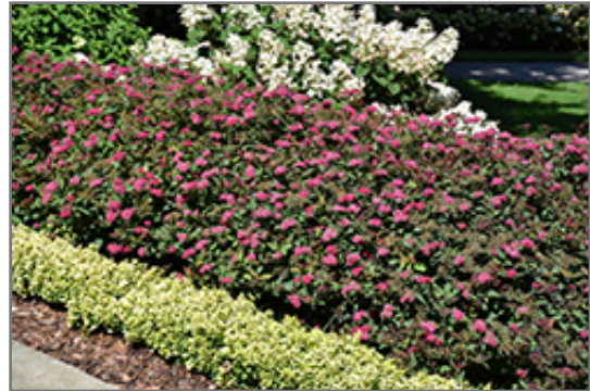
Double Play Doozie Spirea in bloom

This shrub will require occasional maintenance and upkeep, and is best pruned in late winter once the threat of extreme cold has passed. It is a good choice for attracting butterflies to your yard, but is not particularly attractive to deer who tend to leave it alone in favor of tastier treats. It has no significant negative characteristics.