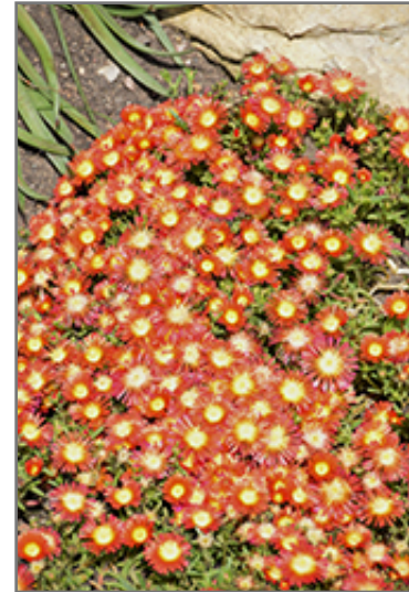
Delmara Red Ice Plant

This is a relatively low maintenance plant, and is best cleaned up in early spring before it resumes active growth for the season. It is a good choice for attracting bees and butterflies to your yard. It has no significant negative characteristics.