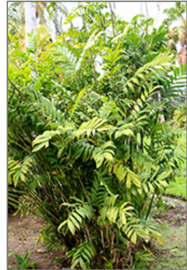
Hardy Bamboo Palm

When grown indoors, Hardy Bamboo Palm can be expected to grow to be about 6 feet tall at maturity, with a spread of 3 feet. It grows at a slow rate, and under ideal conditions can be expected to live for approximately 10 years. This houseplant performs well in both bright or indirect sunlight and strong artificial light, and can therefore be situated in almost any well-lit room or location. It is very adaptable to both dry and moist soil, but will not tolerate any standing water. The surface of the soil shouldn't be allowed to dry out completely, and so you should expect to water this plant once and possibly even twice each week. Be aware that your particular watering schedule may vary depending on its location in the room, the pot size, plant size and other conditions; if in doubt, ask one of our experts in the store for advice. It is not particular as to soil pH, but grows best in rich soil. Contact the store for specific recommendations on pre-mixed potting soil for this plant.