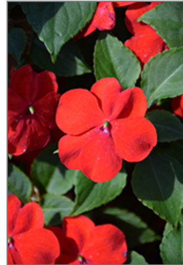
Beacon Bright Red Impatiens flowers

Beacon Bright Red Impatiens is recommended for the following landscape applications;