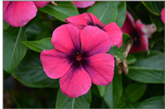
Tattoo Raspberry Vinca flowers

Tattoo Raspberry Vinca is a dense herbaceous annual with a mounded form. Its medium texture blends into the garden, but can always be balanced by a couple of finer or coarser plants for an effective composition.