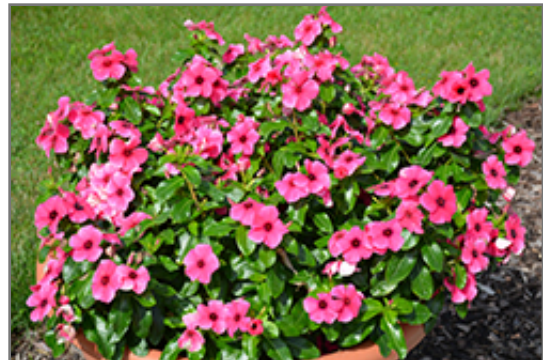
Tattoo Raspberry Vinca in bloom