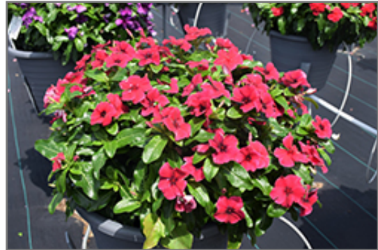
Tattoo Black Cherry Vinca in bloom