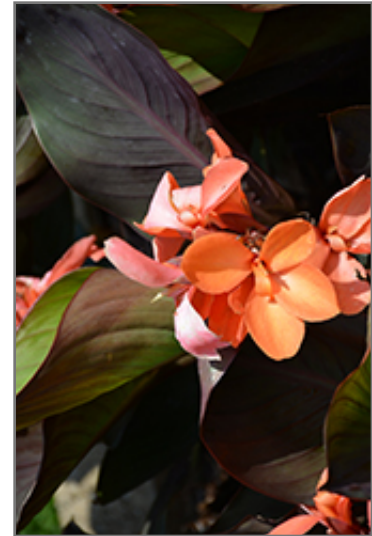
CannaSol Happy Wilma Canna flowers

This plant is native to the tropics and prefers growing in moist environments with evenly warm conditions all year round. In our climate, it is usually grown as an outdoor annual in the garden or in a container. If you want it to survive the winter, it can be brought in to the house and provided with special care, and then returned to the garden the following season. In its preferred tropical habitat, it can grow to be around 18 inches tall at maturity, with a spread of 14 inches. However, when grown as an annual or when overwintered indoors, it can be expected to perform differently, and its exact height and spread will depend on many factors; you may wish to consult with our experts as to how it might perform in your specific application and growing conditions.