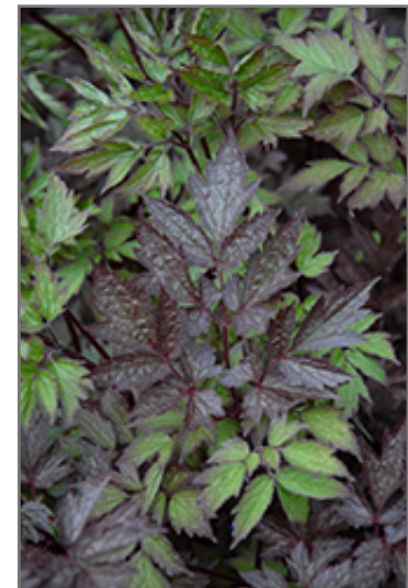
Black Negligee Bugbane foliage