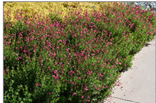
Pink Autumn Sage in bloom