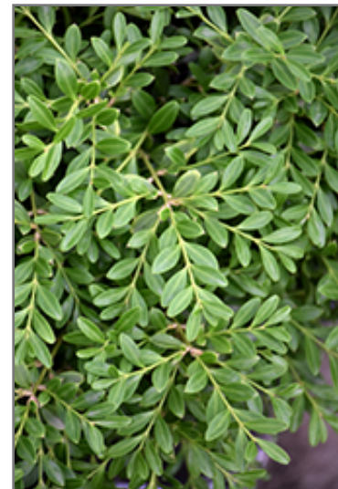
Green Borders Boxwood foliage