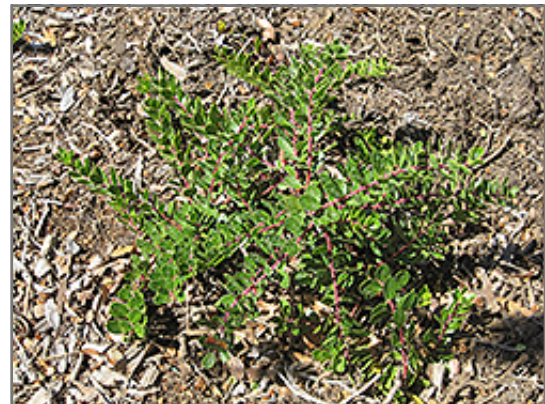
Emerald Carpet Manzanita