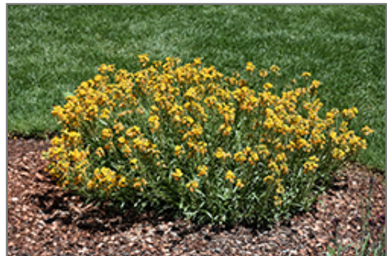
Cheers Florange Wallflower in bloom