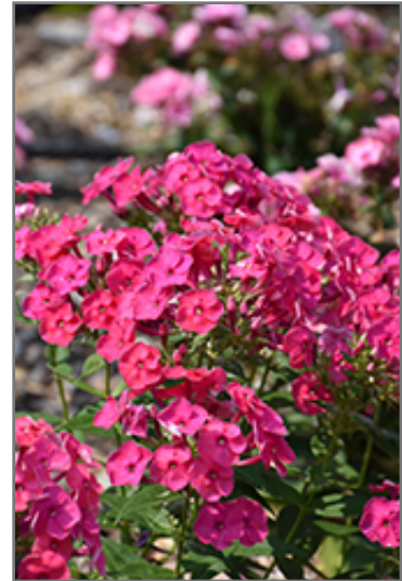
Ka-Pow Pink Garden Phlox flowers