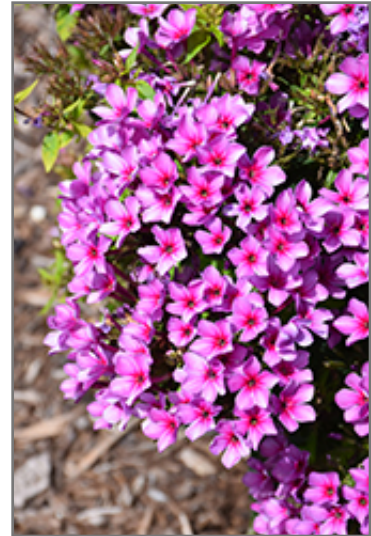
Early Purple Pink Eye Garden Phlox flowers