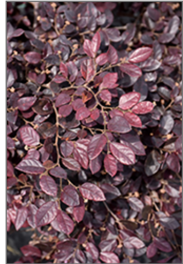
Plum Gorgeous Fringeflower foliage