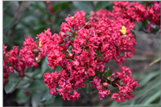
Barista Lava Java Crapemyrtle flowers

This is a relatively low maintenance shrub, and is best pruned in late winter once the threat of extreme cold has passed. It is a good choice for attracting bees to your yard, but is not particularly attractive to deer who tend to leave it alone in favor of tastier treats. It has no significant negative characteristics.