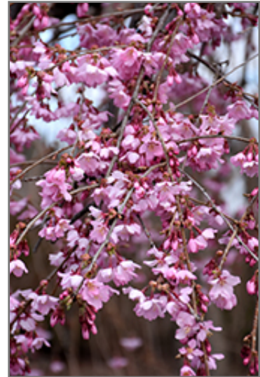
Pink Cascade Weeping Cherry flowers