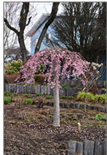
Pink Cascade Weeping Cherry in bloom