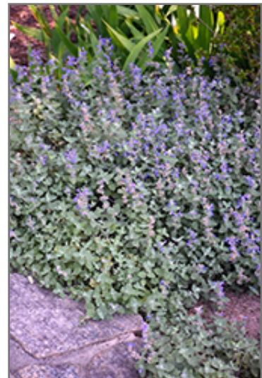
Early Bird Catmint in bloom