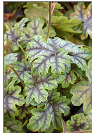
Tapestry Foamy Bells foliage