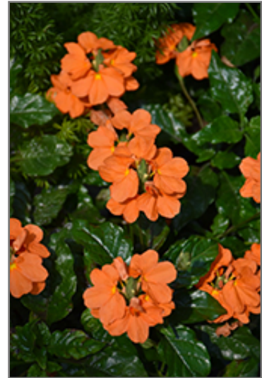
Orange Marmalade Firecracker Plant flowers

This plant does best in full sun to partial shade. It does best in average to evenly moist conditions, but will not tolerate standing water. It is not particular as to soil pH, but grows best in rich soils. It is somewhat tolerant of urban pollution. This is a selected variety of a species not originally from North America. It can be propagated by cuttings; however, as a cultivated variety, be aware that it may be subject to certain restrictions or prohibitions on propagation.