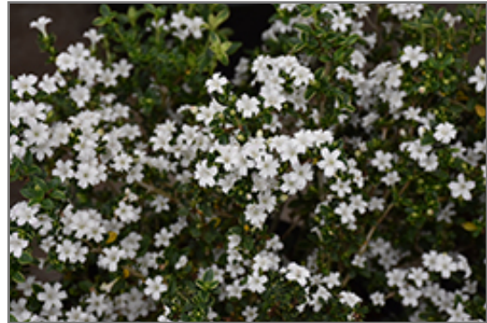
Variegated Serissa flowers

This is a dense multi-stemmed evergreen houseplant with an upright spreading habit of growth. Its extremely fine and delicate texture is quite ornamental and should be used to full effect. This plant may benefit from an occasional pruning to look its best.