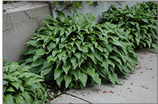
Invincible Hosta

Invincible Hosta is recommended for the following landscape applications;