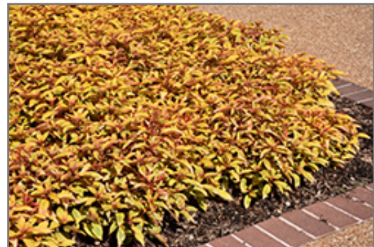
Lime Sizzler Firebush