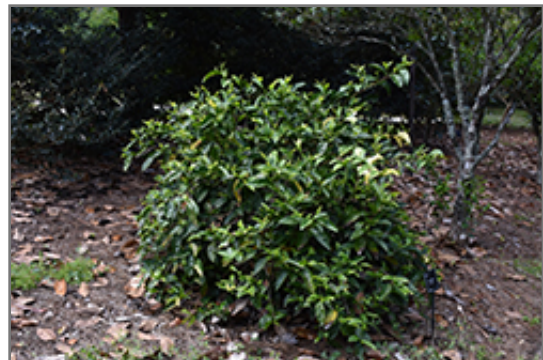
Yellow Tea Plant