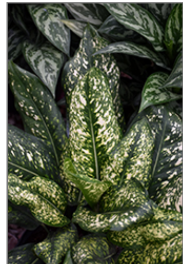
Lumina Chinese Evergreen foliage