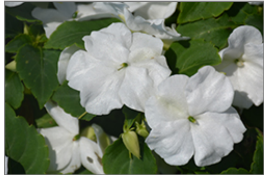
Accent Premium White Impatiens flowers

Accent Premium White Impatiens is recommended for the following landscape applications;