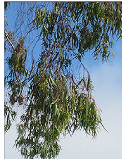
Lemon-scented Gum foliage