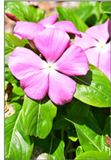
Mega Bloom Pink Vinca flowers

This plant will require occasional maintenance and upkeep, and should not require much pruning, except when necessary, such as to remove dieback. It is a good choice for attracting butterflies to your yard, but is not particularly attractive to deer who tend to leave it alone in favor of tastier treats. It has no significant negative characteristics.