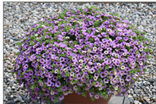
Chameleon Plum Cobbler Calibrachoa in bloom