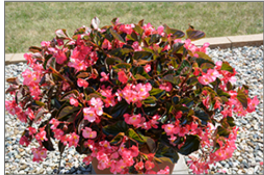
Megawatt Pink Bronze Leaf Begonia in bloom

Megawatt Pink Bronze Leaf Begonia is a fine choice for the garden, but it is also a good selection for planting in outdoor containers and hanging baskets. With its upright habit of growth, it is best suited for use as a 'thriller' in the 'spiller-thriller-filler' container combination; plant it near the center of the pot, surrounded by smaller plants and those that spill over the edges. It is even sizeable enough that it can be grown alone in a suitable container. Note that when growing plants in outdoor containers and baskets, they may require more frequent waterings than they would in the yard or garden.