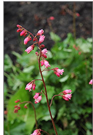
Brandon Pink Coral Bells flowers