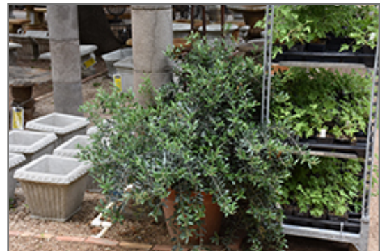
Little Ollie&reg Dwarf Olive