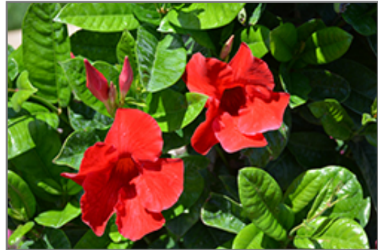
Sun Parasol Pretty Crimson Mandevilla flowers

This is a multi-stemmed evergreen houseplant with a spreading, ground-hugging habit of growth. This plant can be pruned at any time to keep it looking its best.