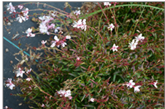
Gaudi Pink Gaura in bloom