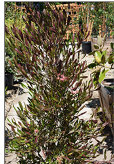
Purple Hop Bush