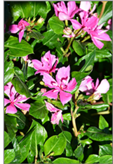
Soiree Kawaii Double Pink Vinca flowers

Soiree Kawaii Double Pink Vinca is recommended for the following landscape applications;