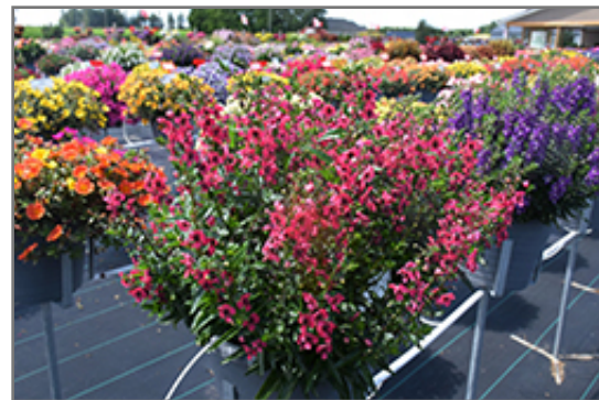
Archangel Cherry Red Angelonia in bloom