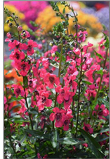
Archangel Cherry Red Angelonia flowers

Archangel Cherry Red Angelonia is a fine choice for the garden, but it is also a good selection for planting in outdoor containers and hanging baskets. It is often used as a 'filler' in the 'spiller-thriller-filler' container combination, providing a mass of flowers against which the larger thriller plants stand out. Note that when growing plants in outdoor containers and baskets, they may require more frequent waterings than they would in the yard or garden.