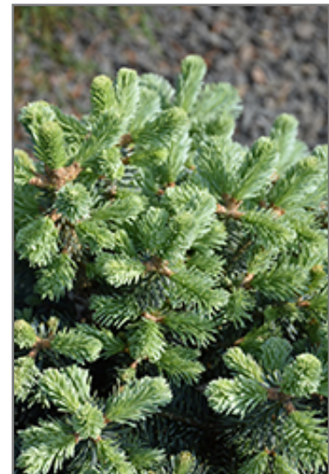
Dwarf Blue Rocky Mountain Fir foliage