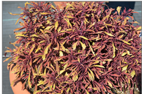
Under the Sea Sea Urchin Red Coleus