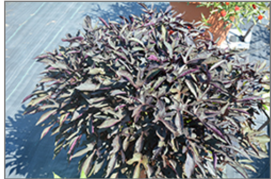
South of the Border Black Beans Sweet Potato Vine

South of the Border Black Beans Sweet Potato Vine will grow to be about 8 inches tall at maturity, with a spread of 3 feet. When grown in masses or used as a bedding plant, individual plants should be spaced approximately 12 inches apart. Its foliage tends to remain low and dense right to the ground. This fast-growing annual will normally live for one full growing season, needing replacement the following year.