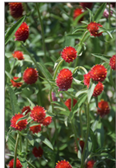
Budacious Radiant Red Gomphrena flowers