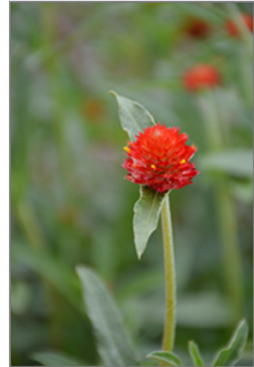
Budacious Radiant Red Gomphrena flowers

Budacious Radiant Red Gomphrena is recommended for the following landscape applications;