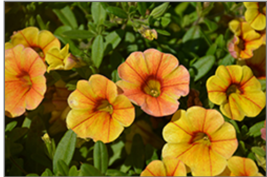
Kimono Tokyo Sunset Calibrachoa flowers

Kimono Tokyo Sunset Calibrachoa is recommended for the following landscape applications;