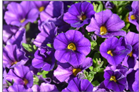
Catwalk Perfect Purple Calibrachoa flowers

Catwalk Perfect Purple Calibrachoa is recommended for the following landscape applications;