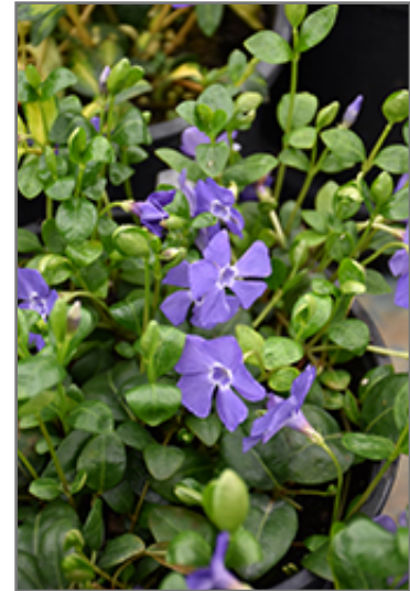
Bowles Cunningham Periwinkle flowers

This is a high maintenance plant that will require regular care and upkeep, and should not require much pruning, except when necessary, such as to remove dieback. Deer don't particularly care for this plant and will usually leave it alone in favor of tastier treats. Gardeners should be aware of the following characteristic(s) that may warrant special consideration;