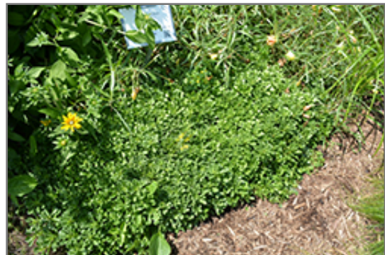
Czar's Gold Stonecrop