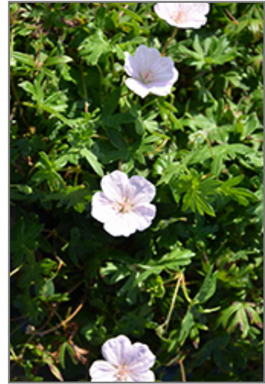
Pink Summer Cranesbill flowers

Pink Summer Cranesbill is recommended for the following landscape applications;