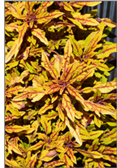
Hipsters Zooey Coleus foliage

Hipsters Zooey Coleus is recommended for the following landscape applications;