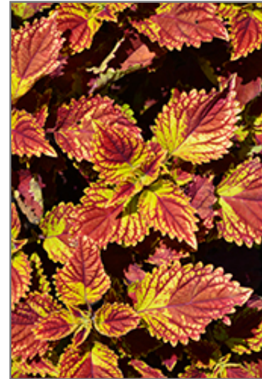
Color Clouds Be Mine Coleus foliage

Color Clouds Be Mine Coleus is recommended for the following landscape applications;